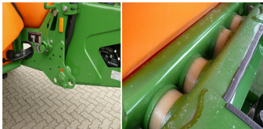
Fig.5/6: Mounting of the drawbar and shock absorbing PU-dampers.

The boom is a framework construction made of steel profiles whose height can be adjusted hydraulically and infinitely by a parallelogram. It comprises a central pendulum with a pendulum range of up to 10° and hydraulic incline adjustment up to an incline of 15 %. It is also possible to work with the outer boom sections stay folded.