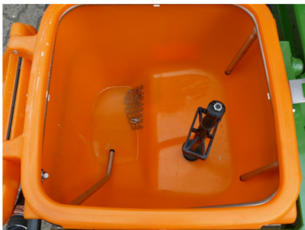
Fig.8: Induction bowl.

The most important functions for filling and agitating are centralised at the operator controls board on the left side of the sprayer.