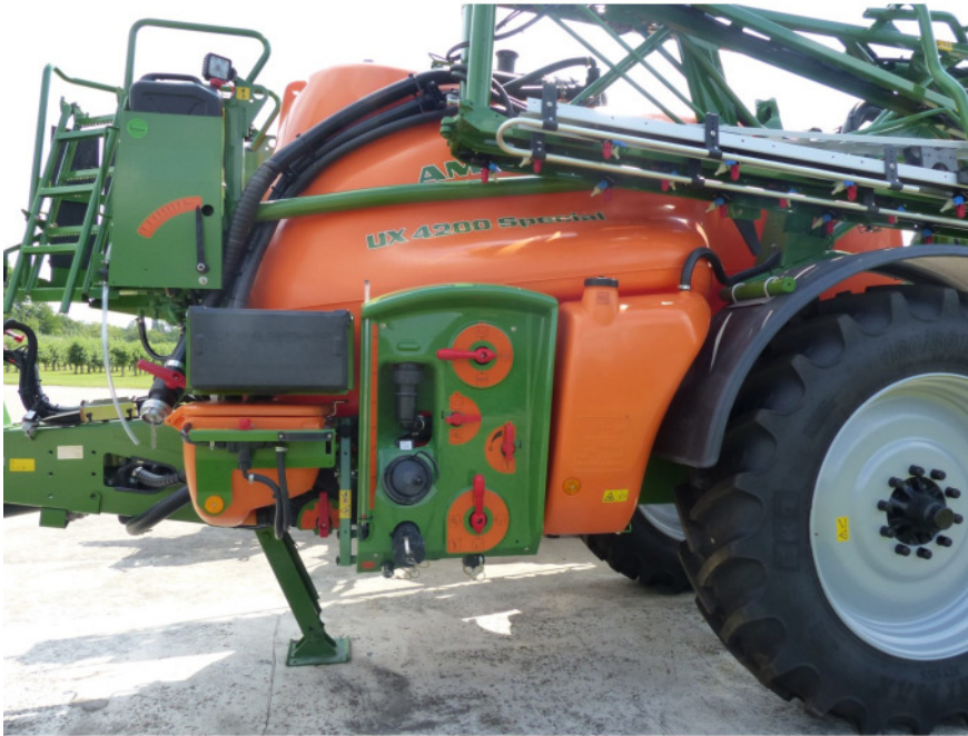
Fig.4: Left sprayer side with contents indicator and induction bowl.

The framework is made of steel profiles, with the tank situated on the top. The non suspended axle was adjusted to a track width of 1.8 m. The suspended drawbar is equipped with PU dampers to reduce the jolts from towing. The framework is designed for a maximum speed of 40 km/h. The pump (altek P380) is placed