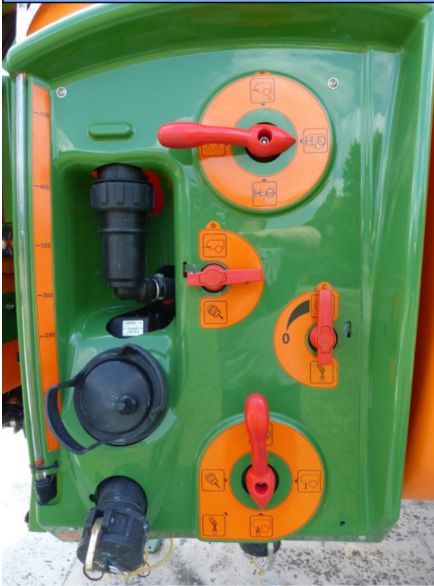
Fig.7: Left sprayer side with new operating panel, filling connections and contents indicator for rinsing water tank.

The sprayer is equipped with a pressurized fluid circulation system (DUS) which assures that the full spray concentration is available for all nozzles right at the beginning of the spray. Also the fluid conducting parts of the boom can be rinsed independently. The circulation system works with a fixed liquid pressure in the pipes but it can also be completely switched off. Thanks to this (overpressure) recirculation system the amount of non delutable residual can be reduced to about 1.5 l. The spray level reading is possible manually (at the left sprayer side) or on the display. Both level indicators fulfill the accuracy requirements entirely.